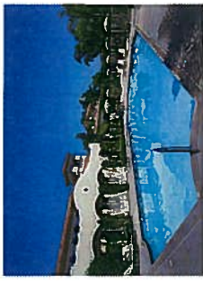
Mendocino, San Clemente