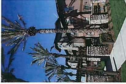
Vineyard Town Homes, Anaheim

Our work has resulted in the production or approval of more than 3,500 affordable rental homes--homes that would not have been possible without the Commission's leadership.