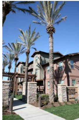
Vineyard Town Homes, Anaheim

Our work has resulted in the production or approval of more than 3,500 affordable rental homes--homes that would not have been possible without the Commission's leadership.